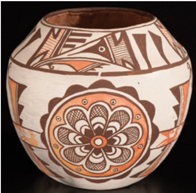
< Celeci Ta Vicenti (United States, Zuni, born 1911), polychrome shoulder jar, early 20th century, earthenware, 6 x 7 1/4 x 7 in. Gift of Mel and Mary Cottom.