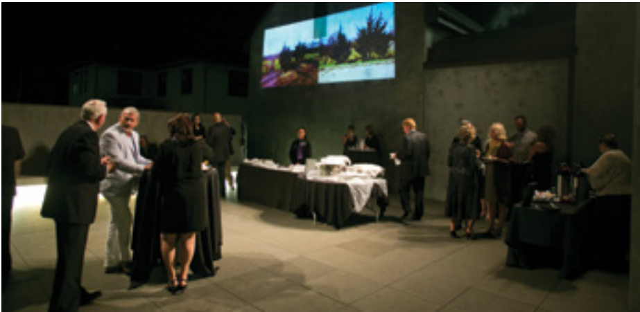
Patrons in the Stolzer Family Foundation Gallery during the Night of Wonder