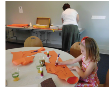
Young participants making kites for Japanese Children's Day (Koi Nobari).