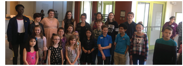
Early Expressions winners 2017.

Information on ARTSmart Summer programs and Young Artists workshops will be ready at the end of March.