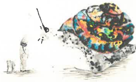
Dorothy Questions the Universe , 2016 Neal Ambrose-Smith #2021.2

June 12 & 13: Genre: Fantastical Elements (masks) June 19 & 20: Establishing Setting (scenes) June 26 & 27: Character 1 (mythical creatures) July 10 & 11: Conflict (dragonology) July 17 & 18: Character 2 (puppets) July 24 & 25: Dialogue (clay) July 31 & Aug. 1: Pulling it together (bookmaking)