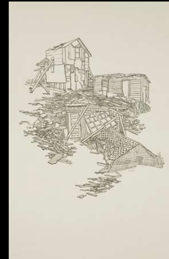
(6) Untitled , 2008