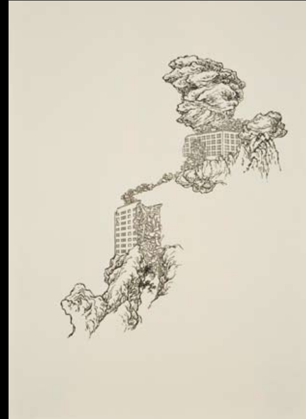
(2) Untitled , 2008