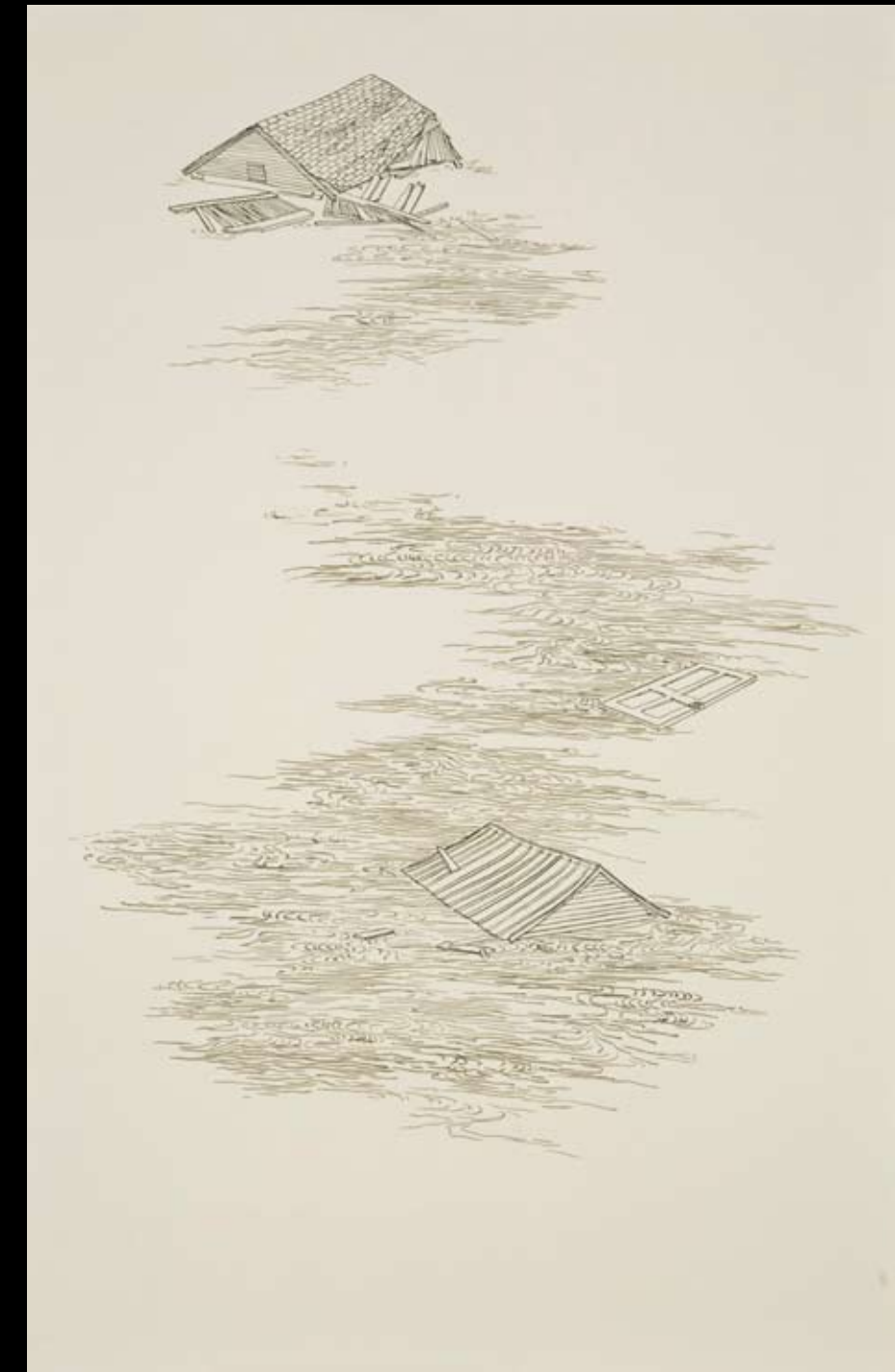
(3) Untitled , 2008