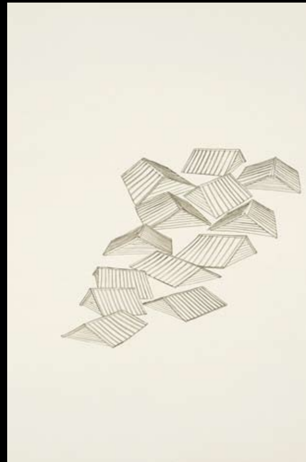
(8) Untitled , 2008