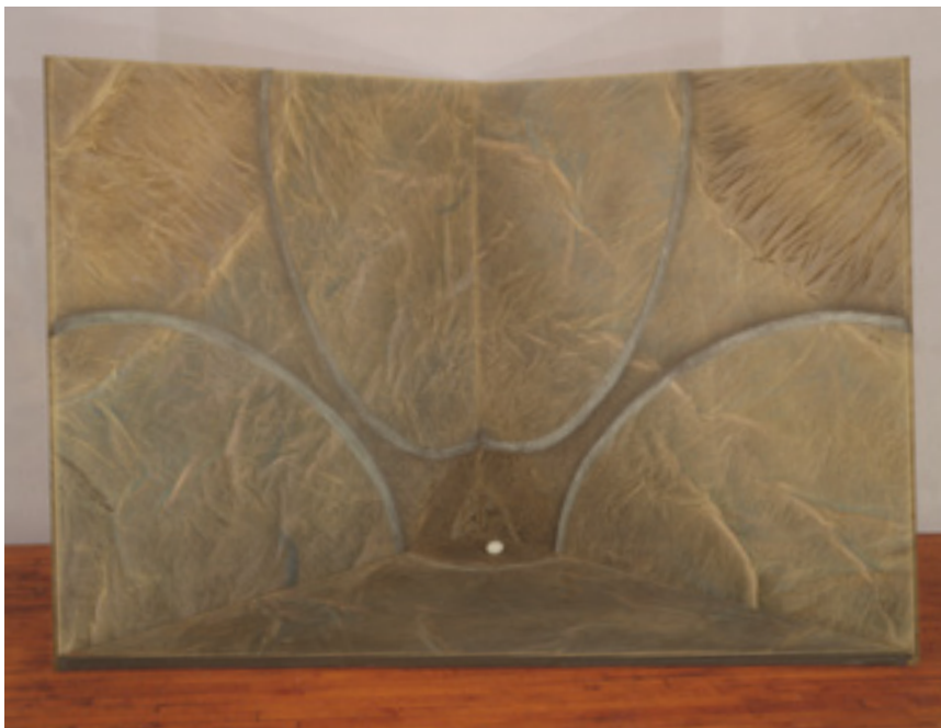
< Shirley Smith (United States, 1929–2013), Soft Landing , 1970, acrylic on canvas (unbleached muslin), three parts, overall, 66 x 89 x 66 in., KSU, Beach Museum of Art, gift of Shirley Smith estate