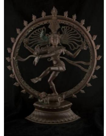
Figure of Dancing Shiva Nataraja, 20th century Undetermined (India) KSU, Beach Museum of Art, 1985.155

Registration is required. $5 per participant (cash or check)