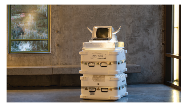
Field Station 4.