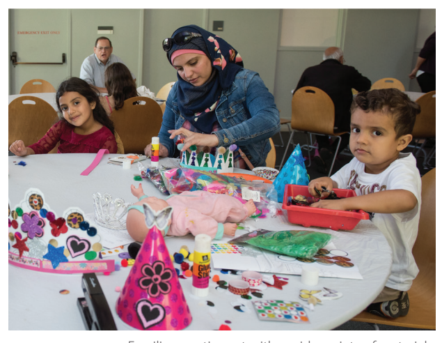
Families creating art with a wide variety of materials.