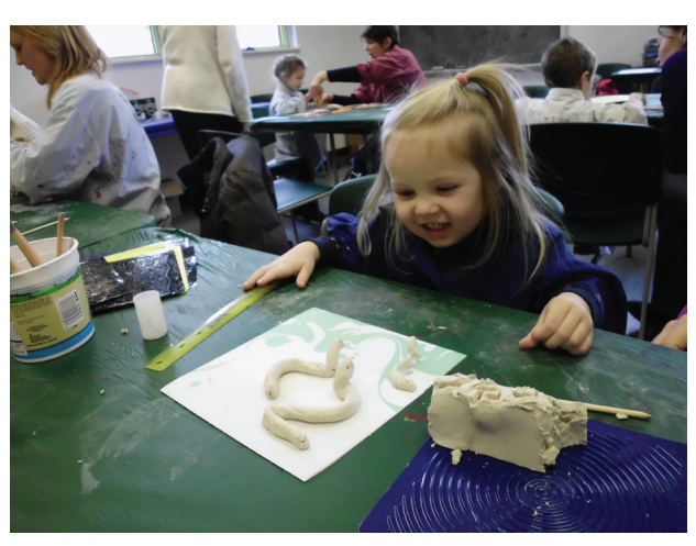
ARTSmart families creating 3-D art.