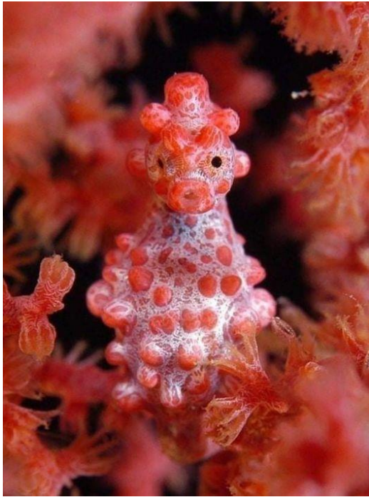
Leafy Sea Dragon, Pygmy Seahorse and a Sea Cucumber