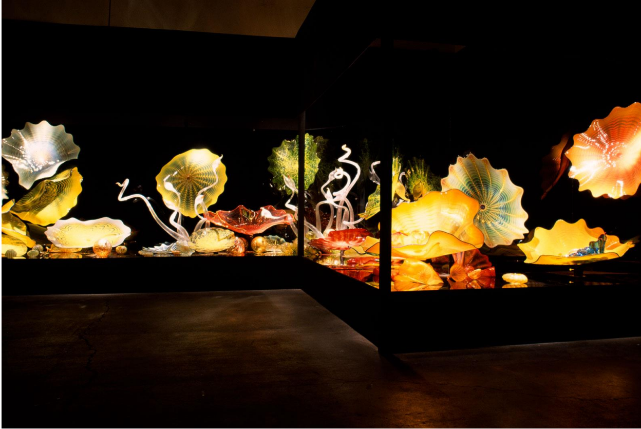
Dale Chihuly, Seaform Installation , 2002, 5 x 30', Monterey Bay Aquarium, Monterey, California

Wendy Ellsworth Sea Form Gallery (bead art)