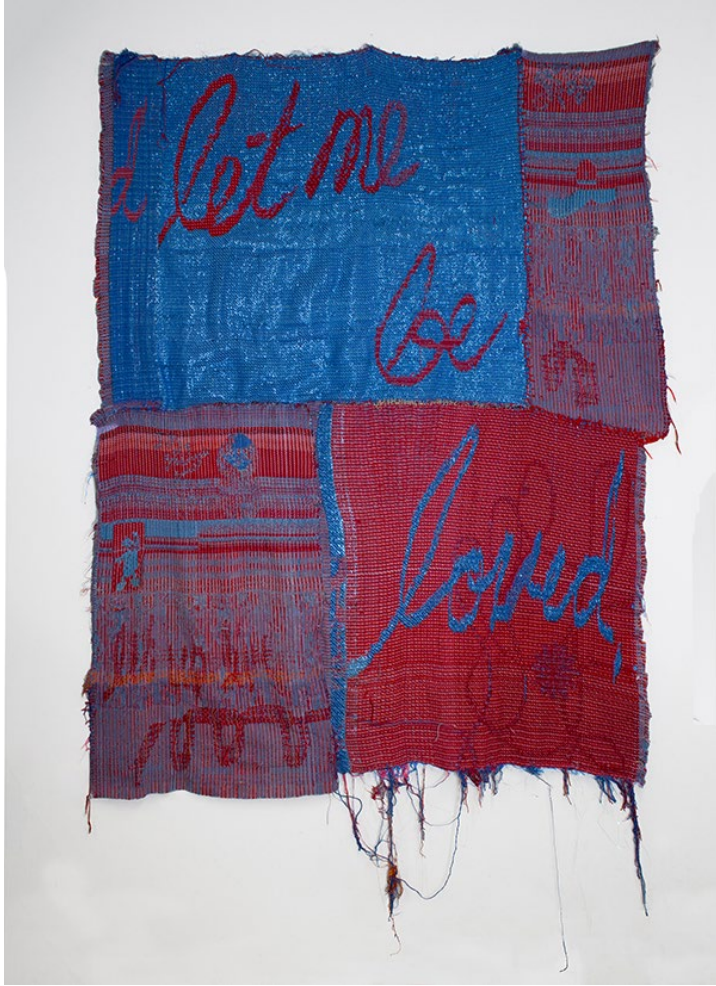
"LMBL" by Poppy DeltaDawn, 2025, handwoven mylar and cotton thread, 75 x 59 in.

Mark Cowardin, Lawrence , presents sculptural installations constructed from wood, metal, ceramics and industrial components. His practice navigates themes of consumption, sacredness and interconnected systems, often incorporating functional elements like ladders and lighting to represent both utility and metaphor.