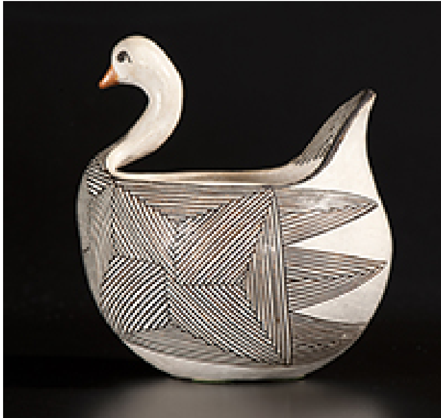
"Duck effigy bowl" by Rose Chino Garcia is early 20th-century earthenware with pigment and a part of the new Beach Museum of Art virtual exhibition, "Two by Two: Animal Pairs."